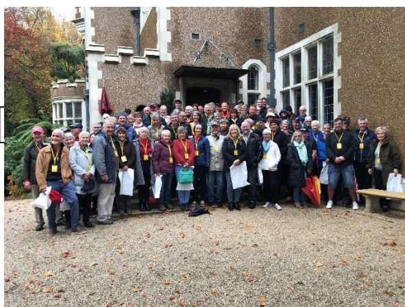
The 2018 ACO starters at Dunedin’s Historic Olveston Home.